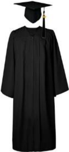
Cap, Gown, & Tassel Unit